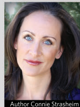
Author Connie Strasheim

Until recently, the Lyme disease community has focused mostly upon treating tick-borne infections, and often not obtained, or seen, complete remission from disease. By treating the major underlying causes of disease described in this book, people with Lyme can increase their chances for a faster and more complete recovery, and doctors can witness more of their patients experience freedom from disease.